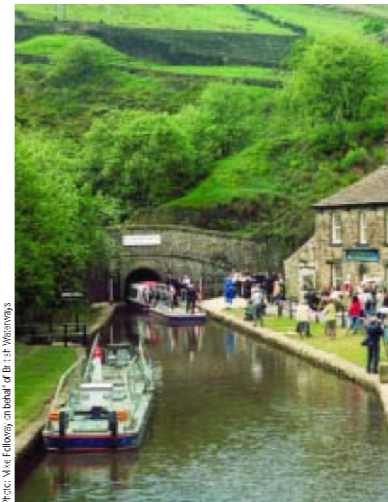
Huddersfield Narrow Canal

scheme, planting over 1.5 million trees to create some 250 new woods, which in turn are improving and extending wildlife habitats, neutral meadows and pastures.