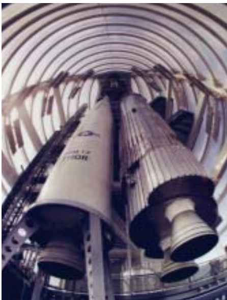
Above: the Rocket Tower at the National Space Centre in Leicester, the United Kingdom's only visitor attraction devoted to the study of space science.

The most visible aspects of the Commission's work are the Millennium Capital Projects, to which over £1.3 billion of funding was allocated. These buildings and environmental projects are nearly all complete, the first having opened in 1996 and the last due for completion by 2006.