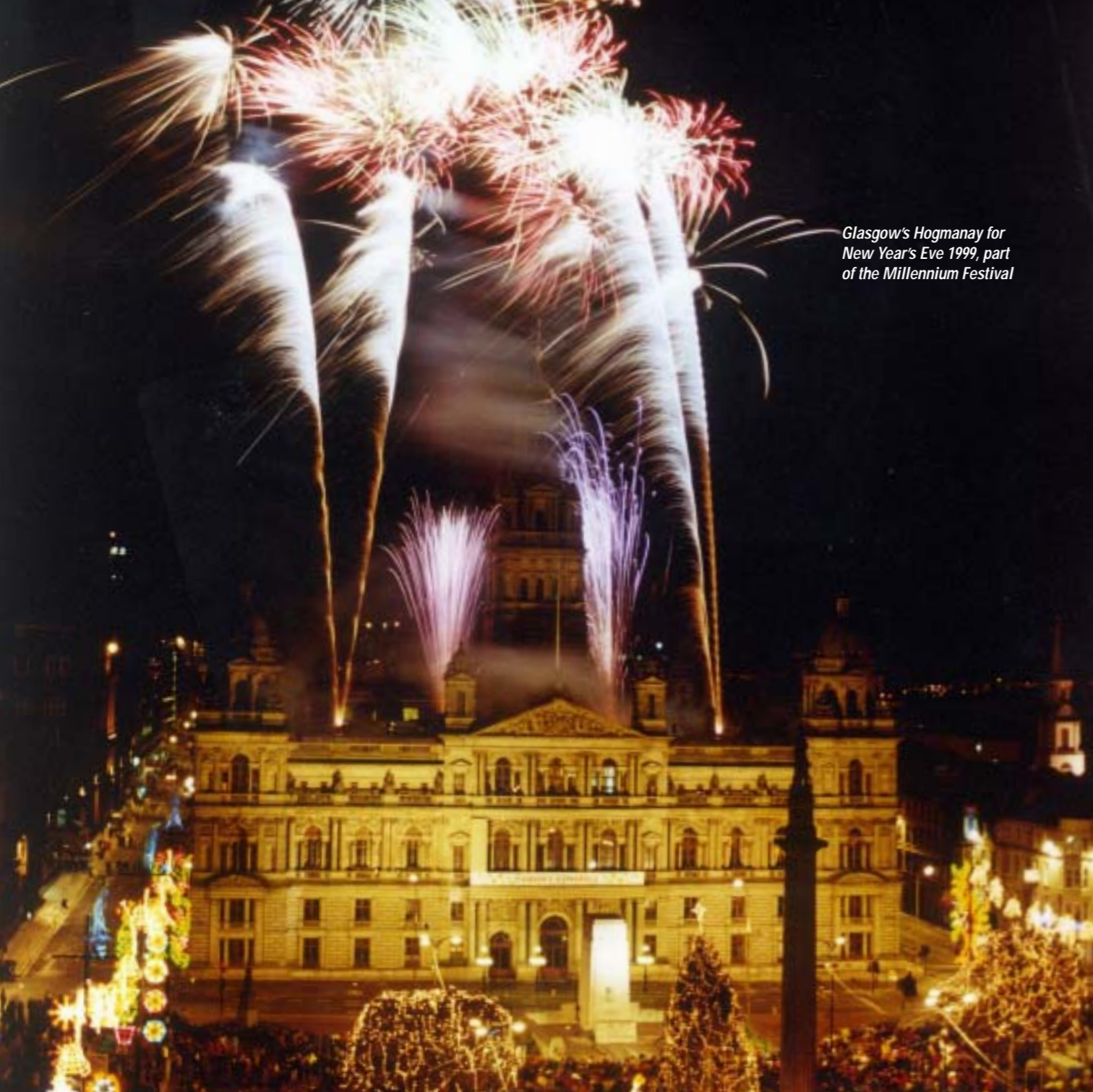
Glasgow's Hogmanay for New Year's Eve 1999, part of the Millennium Festival