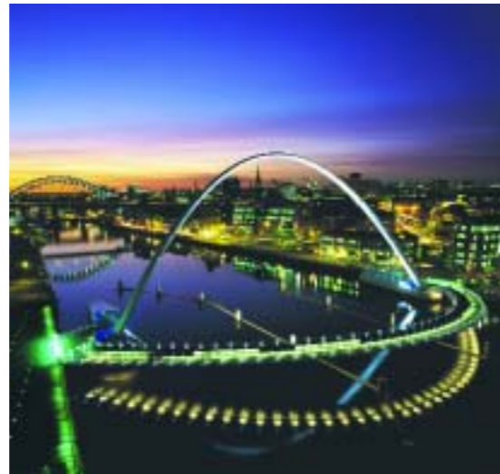
Gateshead Millennium Bridge

By the time the Commission is wound up in 2006, it will have created more than 220 capital projects, made more