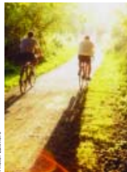
The National Cycle Network, created by Sustrans, the sustainable transport charity