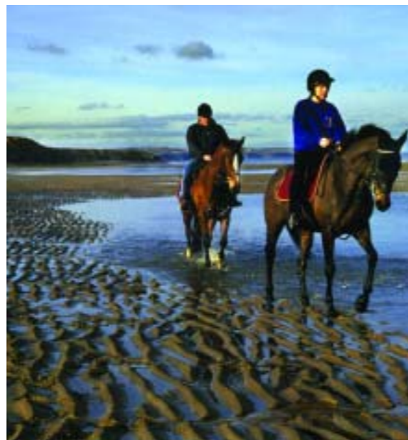
Turning the Tide, Durham coastline

When it decided to fund science centres, the Commission saw its role as purely the funder. However, it recognised that in order to continue to be relevant and to continue to attract visitors, science centres needed to update and renew their exhibits. Funding refurbishment from revenue is never easy and so the Millennium Commission created the ReDiscover fund. A joint venture between the Commission, the Wellcome Trust and the Wolfson Foundation, ReDiscover is a £33 million fund to renew, replace, refresh or redevelop high-quality science, education and technology exhibitions. It represents an important partnership between the Lottery and major non-Government funders. The projects supported so far include Satrosphere in Aberdeen, the London Wetland Centre in Barnes and Techniquet in Cardiff.