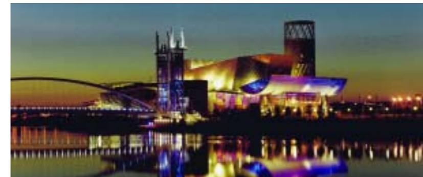
The Lowry at Salford Quays, Manchester

Although we shan't see the Commission's like again in our lifetime, as long as its influence continues to inspire and encourage the people of the United Kingdom, its legacy will live on.