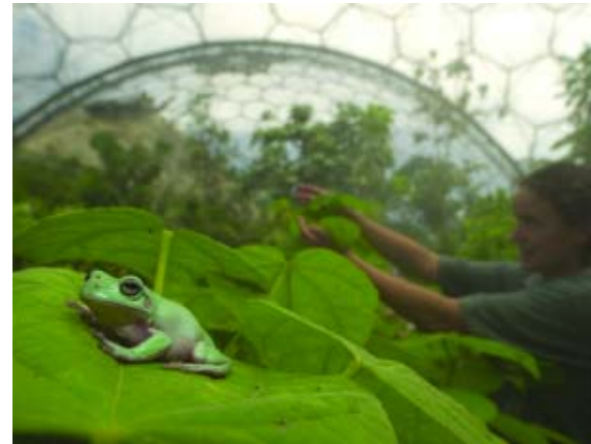
The Eden Project, Cornwall