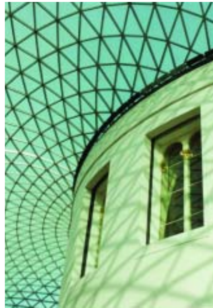
The British Museum Great Court, London

This year, the Millennium Commission, like the National Lottery, is celebrating its 10th birthday. Over the last decade it has invested £2.3 billion of Lottery money in projects, people and celebrations across the United Kingdom.