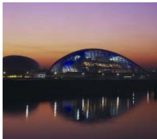
Glasgow Science Centre